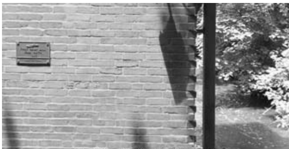
Site of Sarah Whipple-Smith Mill

"Long before jail or meeting-house, the Town mill was the earliest institution of the Plantations. It received much careful oversight from the Town meeting....The mill fixed the centre of the town at the North end, and long kept it there. Around and near it, those who were able, set their houses, and it became not merely the nucleus of population, but